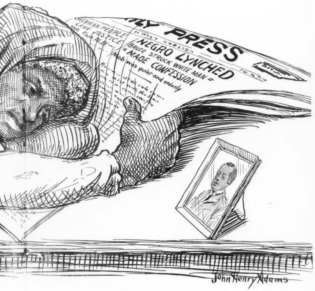
THE NATIONAL PASTIME. Seventy-five per cent. of the Negroes lynched have not even been accused of rape.